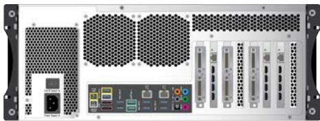
Model GO 28 / 28-RP