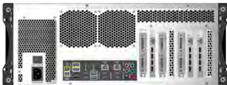
Model GO 28 / 28-RP