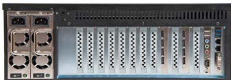
Model GO 44