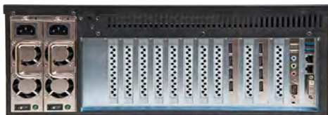
Model GO 44