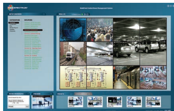
MCMS Drag and Drop Interface