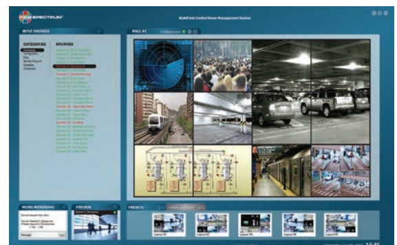
MCMS Drag and Drop Interface