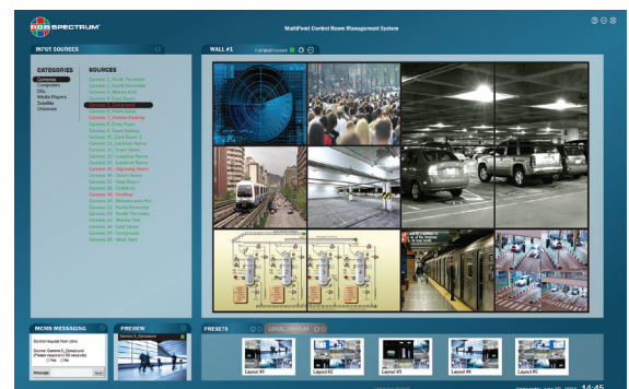
MCMS Drag and Drop Interface