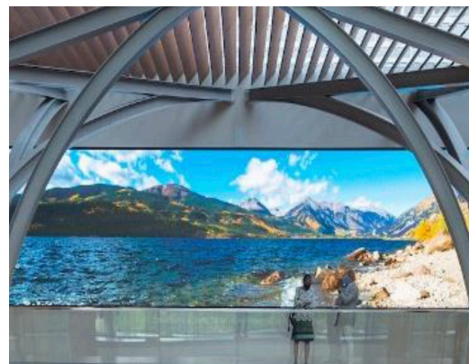
The Denver Botanic Gardens' Freyer-Newman Center engages and entertains patrons with its impressive LED video wall driven by RGB Spectrum's Galileo video wall processor.

The Galileo processor provides a viewing experience with the highest level of video processing performance. It delivers real-time throughput and exceptional 4K image quality, unlike lesser systems that can drop frames or cause image tearing. The processor supports an extensive range of baseband video and IP-based inputs, including analog, AV-over-IP streams, DVI/HDMI, and 3G/HD-SDI.