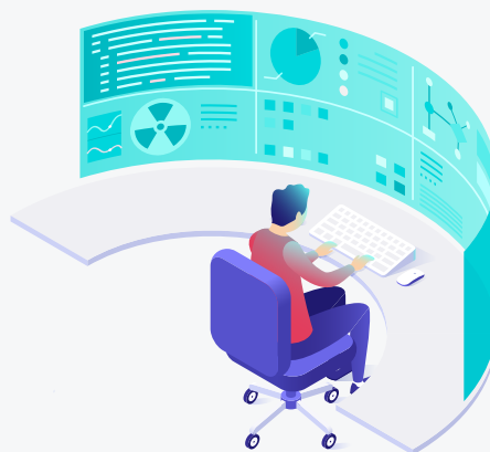
The Desktop Workspace Reimagined