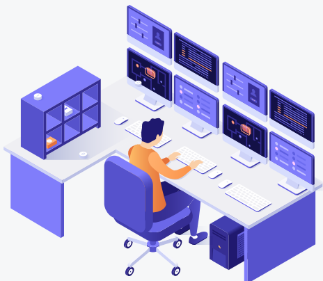
A Typical Desktop Workspace

Attention to ergonomics is critical for improved operator efficiency, reduced fatigue, and better focus.